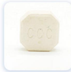
Octagonal lettering tablet