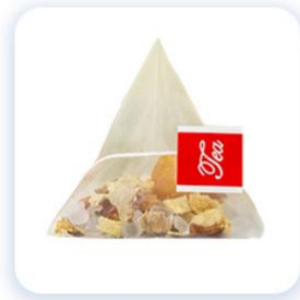
Kumquat Passion Fruit Tea