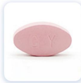
Oval lettering tablet