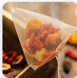
Longan, Red Date, and Goji Berry Tea