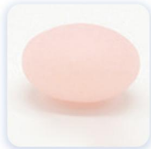
Frosted oval (800mg)