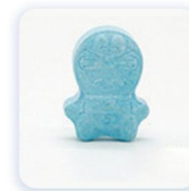
Irregularly shaped tablet