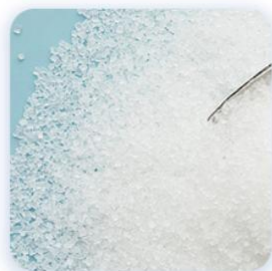
Granular solid beverages