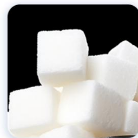
Block solid beverages