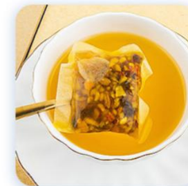
Euryale Ferox, Poria Cocos, and Job's Tears Tea