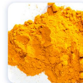
Powdered solid beverages