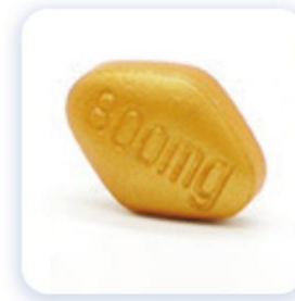
Quadrilateral lettering tablet