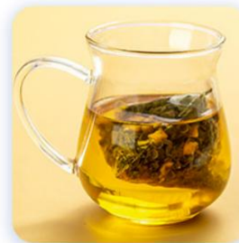
Peach Oolong Tea