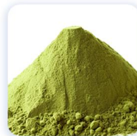
Powdered solid beverages

SOLID BEVERAGE CATEGORY (Note: Only some dosage forms are shown. Please contact us for custom orders.)