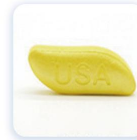
Irregularly shaped lettering tablet