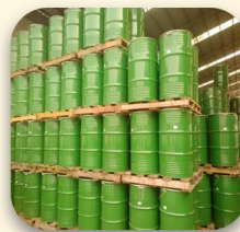
220 Liters Drum