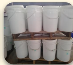
25 Liters Pail