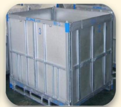
1000 Liters IBC Tons box